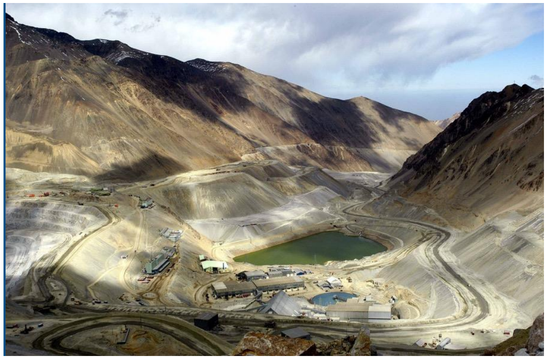
Anglo American's El Soldado copper mine in Chile.

<u>Cecilia Jamasmie</u> | 2 days ago | <mark>0</mark> | 0 _PEOPLEMINE_FACEBOOK_LINKEDIN_TWITTER_EMAIL_</mark>PRINT