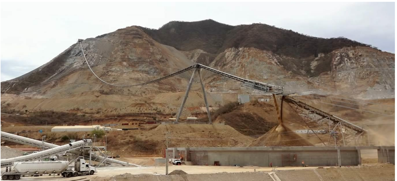
View of a RopeCon installation pictured at El Limon-Guajes, Mexico demonstrates the systems minimal footprint in difficult terrain.

Hot Chili Limited (ASX: HCH) (OTCQB: HHLKF) (“Hot Chili” or “Company”) is pleased to announce that its Pre-feasibility study (PFS) into the combined Costa Fuego copper-gold development in Chile is gaining momentum.