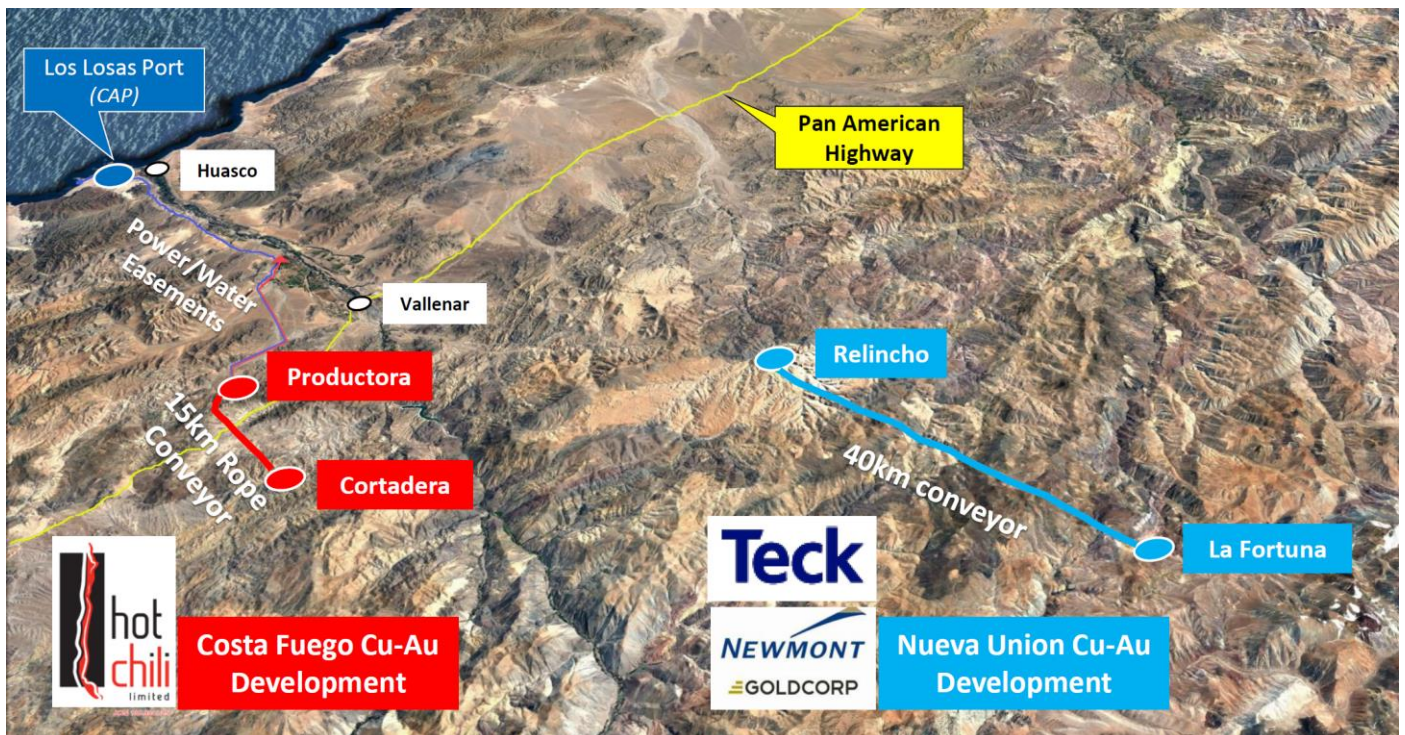
Figure 1. Location of Costa Fuego (Hot Chili) in comparison to Nueva Union (Teck & Newmont Barrick). View looking west-northwest toward the Pacific Ocean.

Nueva Union is located between 2,000 m and 4,000 m elevation, approximately 100 km east-northeast of Costa Fuego, with similar average copper grades and co-credit metals. By comparison, Costa Fuego's Cortadera and Productora copper-gold deposits are located 14 km apart, at low altitude (800 -1,000 m elevation), along the Pan American Highway and within 50 km of port facilities.