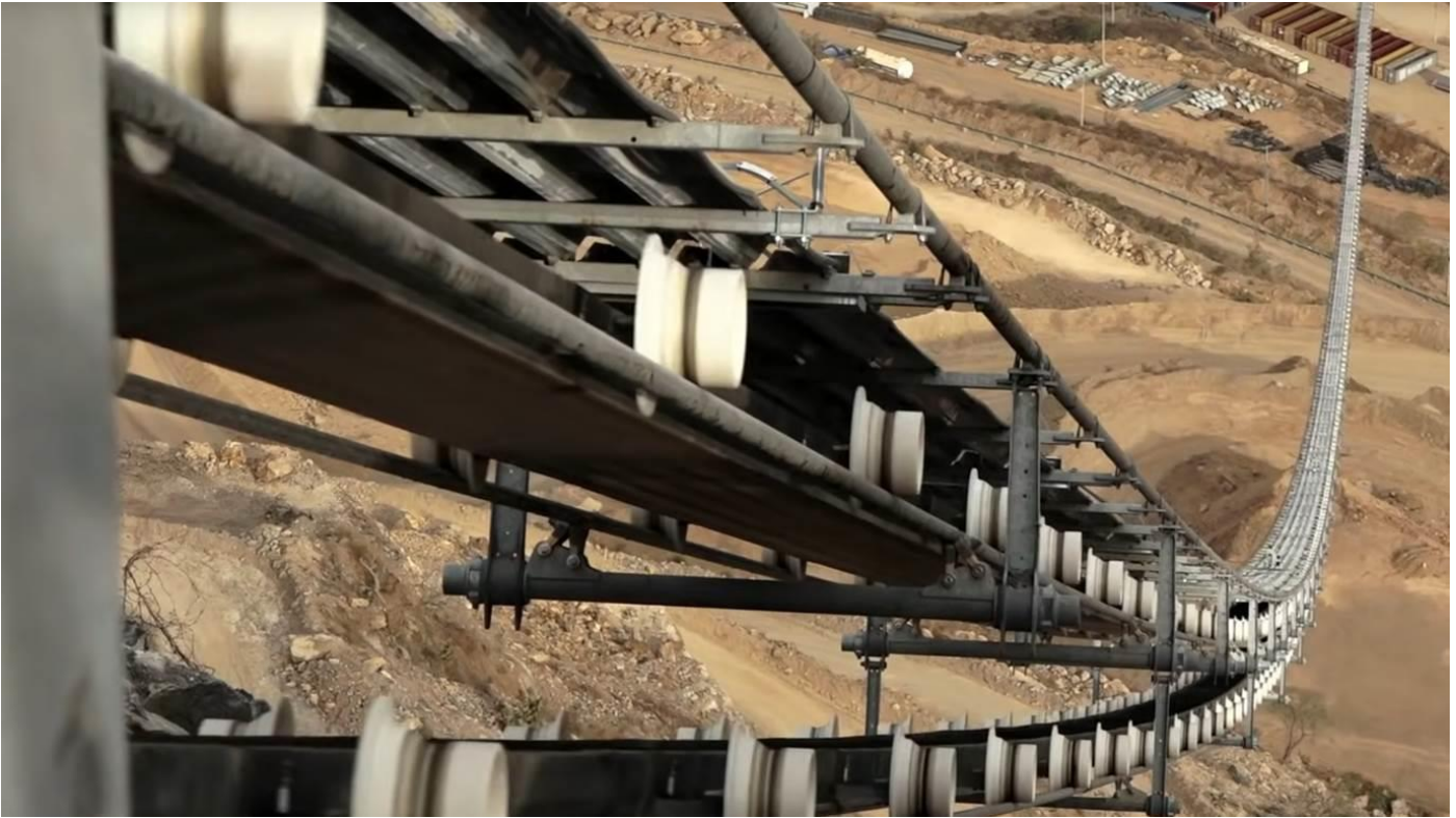
Figure 2. Close-up view - RopeCon transports material on a flat belt with corrugated side walls that is fixed to axles that run on track ropes suspended from tower structures.

This announcement is authorised by the Board of Directors for release to ASX.